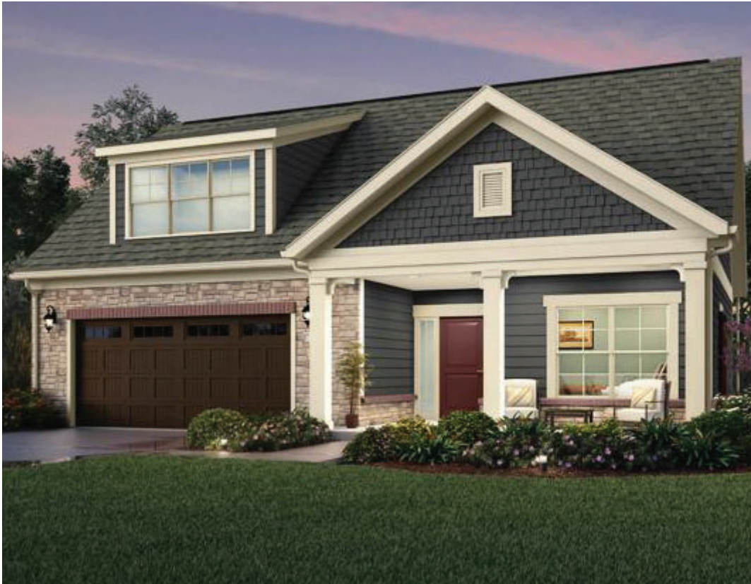
Some features and specifications may vary depending on the architectural style and community.