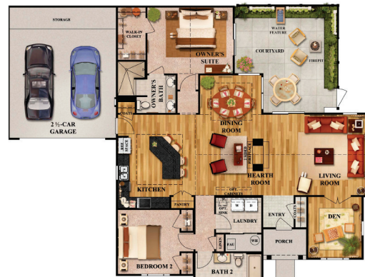
DUCAL - 1,806 SQ. FT.