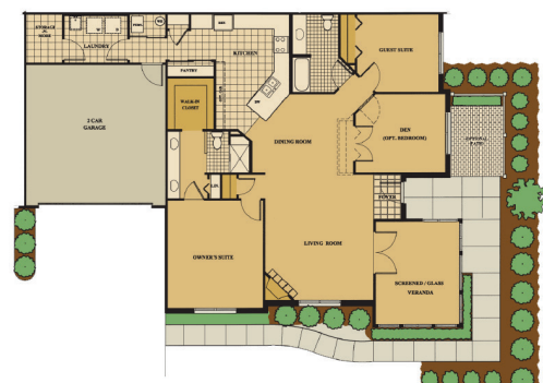
CANTERBURY - 1,861 SQ. FT.