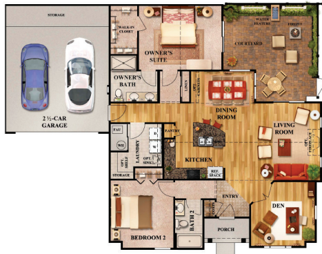
COLONNADE - 1,547 SQ. FT.