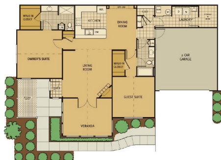
ABBAY - 1,718 SQ. FT.

The Cathedral Series allows one to enjoy the home's spacious open concept great room, soaring ceilings, dining area, breakfast bar, and a lovely four-season veranda. The owners' suite and large guest bedroom offer full baths and walk-in closets. This home also comes complete with a laundry room and a storage-n-more room, keeping your storage needs in mind.