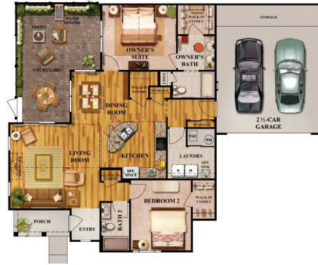
BRAMANTE - 1,400 SQ. FT.