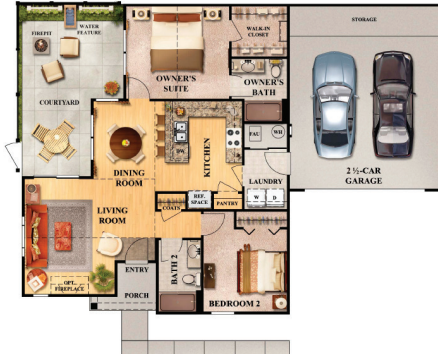
ABORETA 1,137 SQ. FT.

The Courtyard Collection, offers the comfortable fit of “rightsizing” without sacrificing beautiful architectural detail. The openness of the great room sets the tone for the entire floor plan which is intended to enhance the concept of single-story living. Each floor plan includes two bedrooms and two baths, a private outdoor courtyard, and a two and a half stall garage. The owner’s suite features a walk-in closet and a private bath.